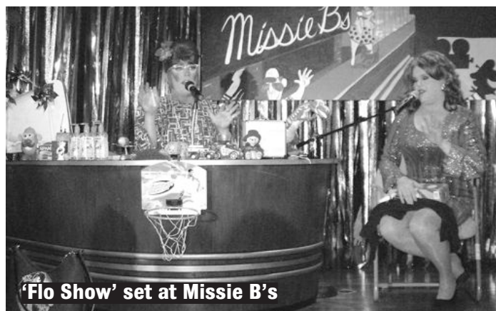
'Flo Show' set at Missie B's