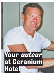
Your auteur at Geranium Hotel