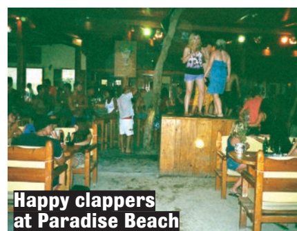
Happy clappers at Paradise Beach