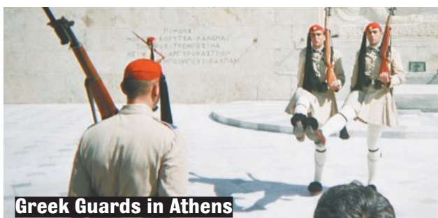
Greek Guards in Athens

Super Paradise Beach has gained an international reputation for the place to be in Mykonos, but I found it less super than Paradise Beach and somewhat more difficult to access. Its waters and sands are super, but it's less organized and has less to offer than Paradise Beach and is a longer journey, about seven kilometers out of Mykonos town. But the beach does boast an array of cute men in Speedos and sunglasses. There is a bar and restaurant – with a pool, too – over-