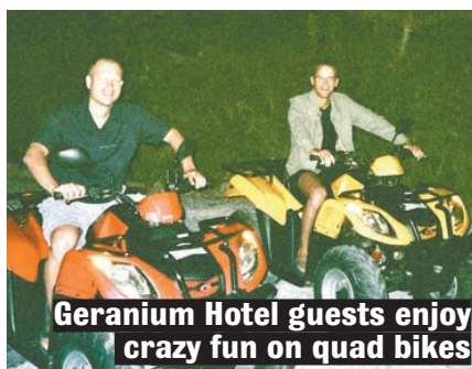
Geranium Hotel guests enjoy crazy fun on quad bikes