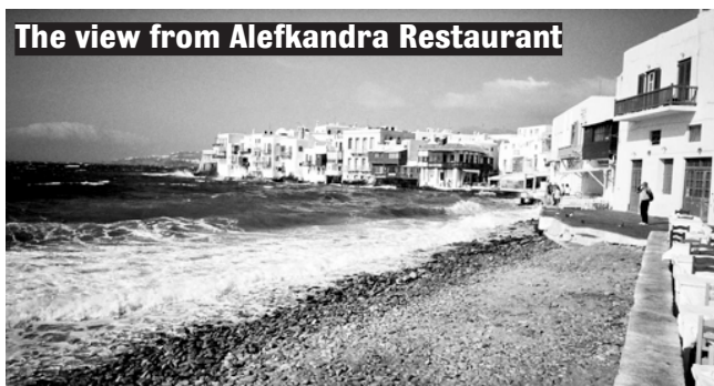
The view from Alefkandra Restaurant