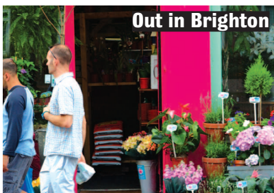
Out in Brighton