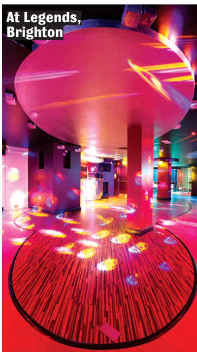
At Legends, Brighton