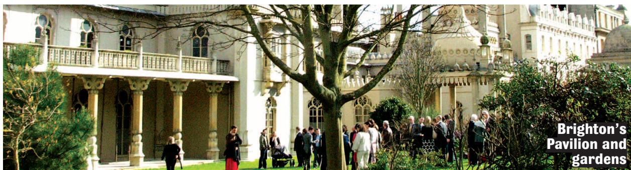
Brighton's Pavilion and gardens