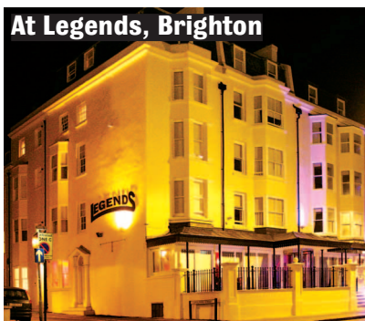
At Legends, Brighton