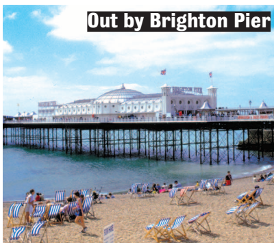
Out by Brighton Pier