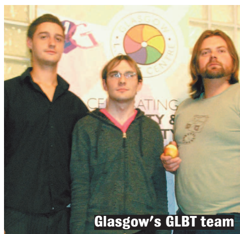
Glasgow's GLBT team