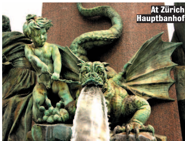
At Zürich Hauptbahnhof