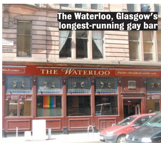
The Waterloo, Glasgow's longest-running gay bar