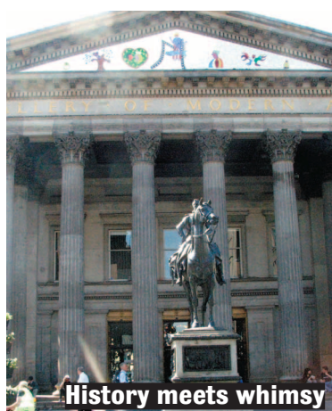
History meets whimsy