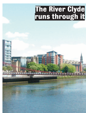
The River Clyde runs through it

there's water and biscuits. Schwartz is centrally located, directly on the corner as you go over Glasgow Bridge away from the city.