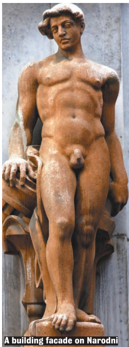
A building facade on Narodni