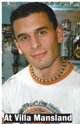
At Villa Mansland