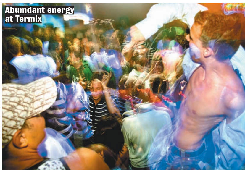
Abundant energy at Termix