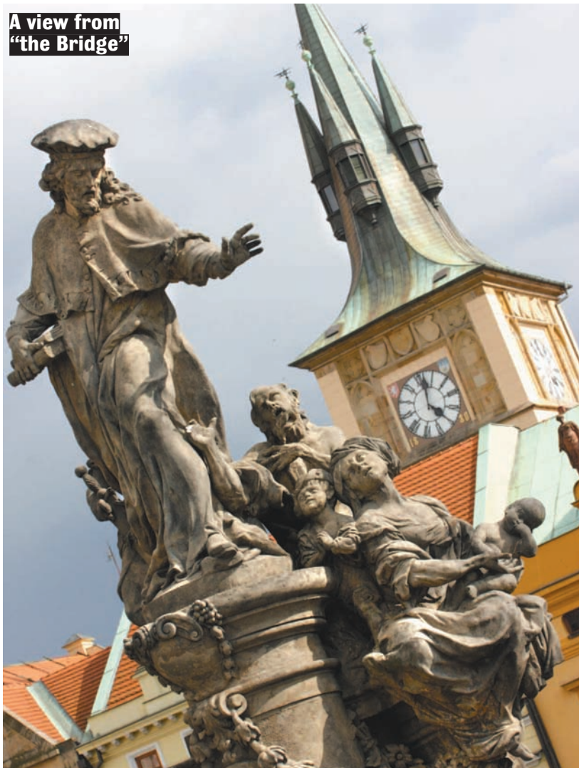
A view from "the Bridge"