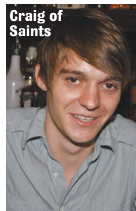
Craig of Saints