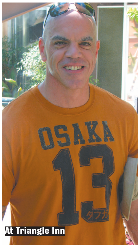
At Triangle Inn