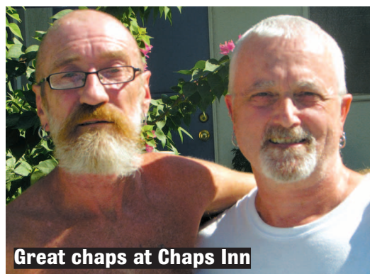
Great chaps at Chaps Inn

ers are in all bungalow suites and bungalow-deluxe studios. There's a steam room, jacuzzi, pools and lots of space here to roam the grounds and find desert gems.