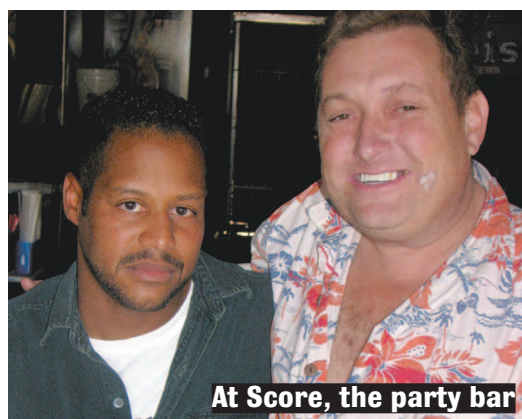
At Score, the party bar